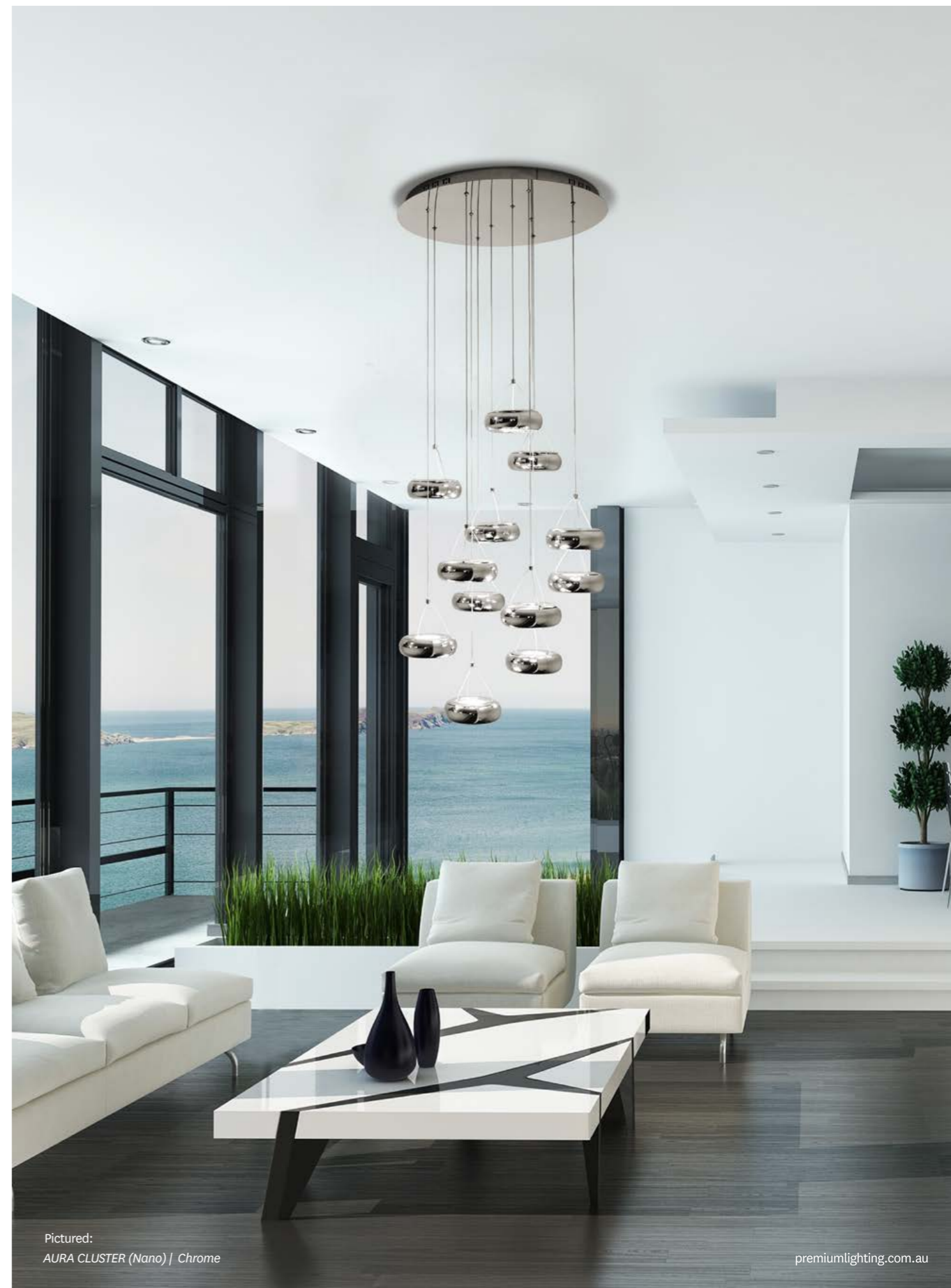
Pictured: AURA CLUSTER (Nano) | Chrome