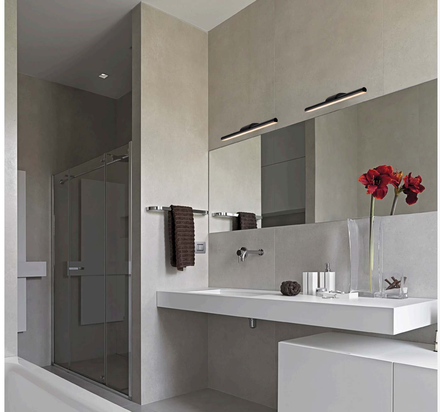
Top: Hotel wall application Right: Protruded diffuser

Material | Powder Coated Aluminium, Frosted Acrylic Diffuser IP | 65 Warranty | 3 Years