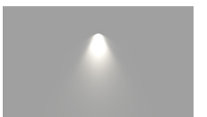
Medium | 40° (M)