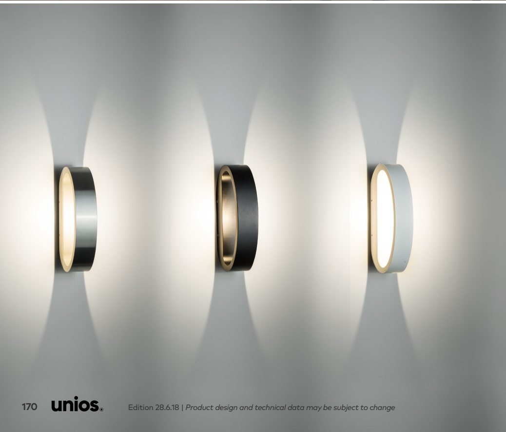
Above: Residential application Left: Wall application