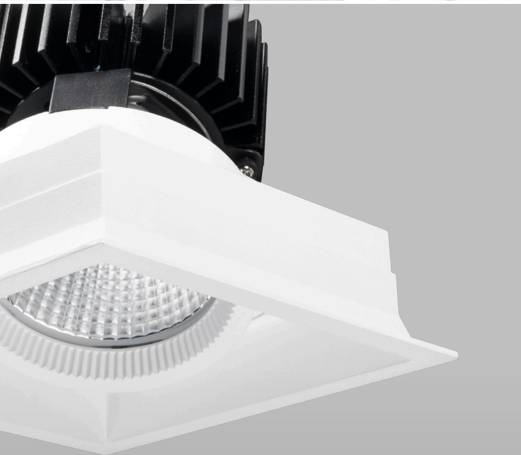
Above: Retail application Left: Adjustable gimbal (up to 30° of tilt)